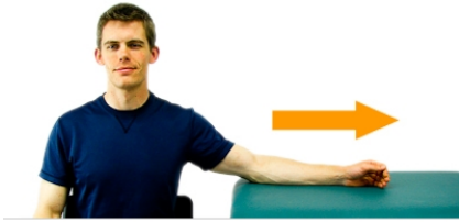
TABLE SLIDE - ABDUCTION

Sitting in a chair, rest your injured arm on a table and gently slide it out to the side and then back.