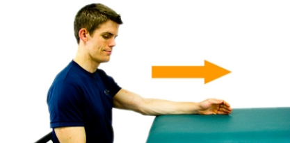
TABLE SLIDE - FLEXION

Sitting in a chair, rest your injured arm on a table and gently slide it forward and then back.